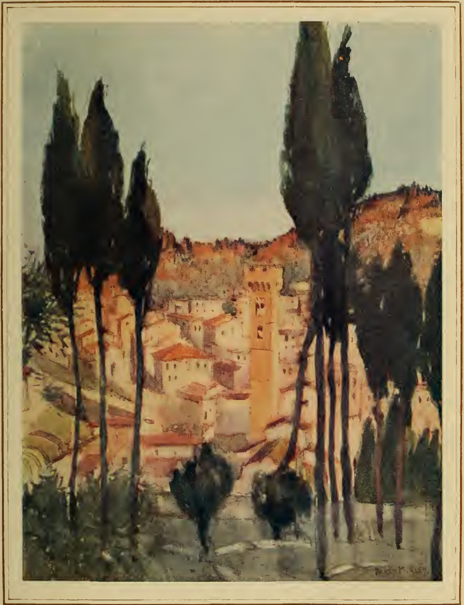
FIESOLE FROM THE HILL UNDER THE MONASTERY